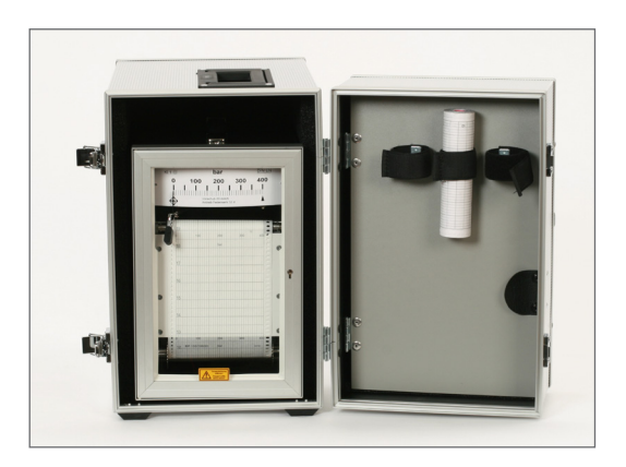
Chart widths / feeds single strip chart recorder 100 mm (standard) double strip chart recorder 2 x 100 mm (standard), optional 120 mm or 2 x 120mm) triple strip chart recorder 3 x 80 mm standard 20 mm/h mechanical 5 up to 1200 mm/h electrical 20 up to 3600 mm/h

electrical, mechanical, 8 or 32 days running time